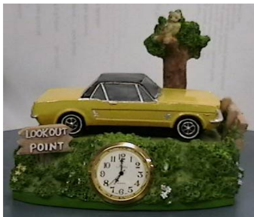
"Official" Club clock to keep meetings on time!.