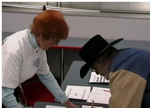
Members settle in for the first meeting of 2008.