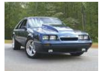
1985 Mustang GT