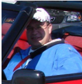
"See you on Friday!"