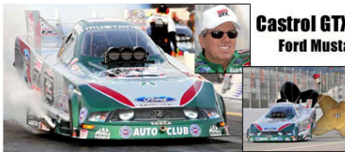
Castrol GTX High Mileage Ford Mustang Funny Car

In the meantime, catch these chest pounding, 8000hp ground shaking funny cars in action at the Mile High Nationals at Bandimere Speedway in Morrison from July 23 rd -25 th . Qualifying sessions will be held on Friday the 23 rd and Saturday the 24 th , with eliminations on Sunday, July 25 th . It is an experience you should have at least once in your lifetime and one you will never forget. Be sure to bring ear plugs!