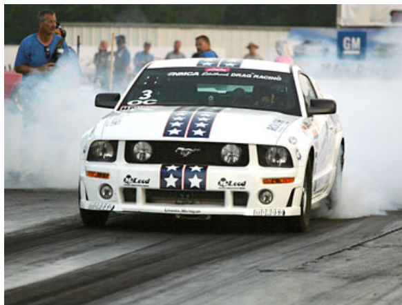
ROUSH® Drag Team’s propane-powered Mustang

Based in Livonia, Mich., “The Art of Performance Engineering” takes place at ROUSH Performance. To get a look behind the scenes at what goes on at ROUSH and how the vehicles are designed, manufactured and produced logon to www.ROUSHtv.com . For more information see your local ROUSH® dealer, visit www.ROUSHperformance.com or telephone toll-free (800) 59-ROUSH.